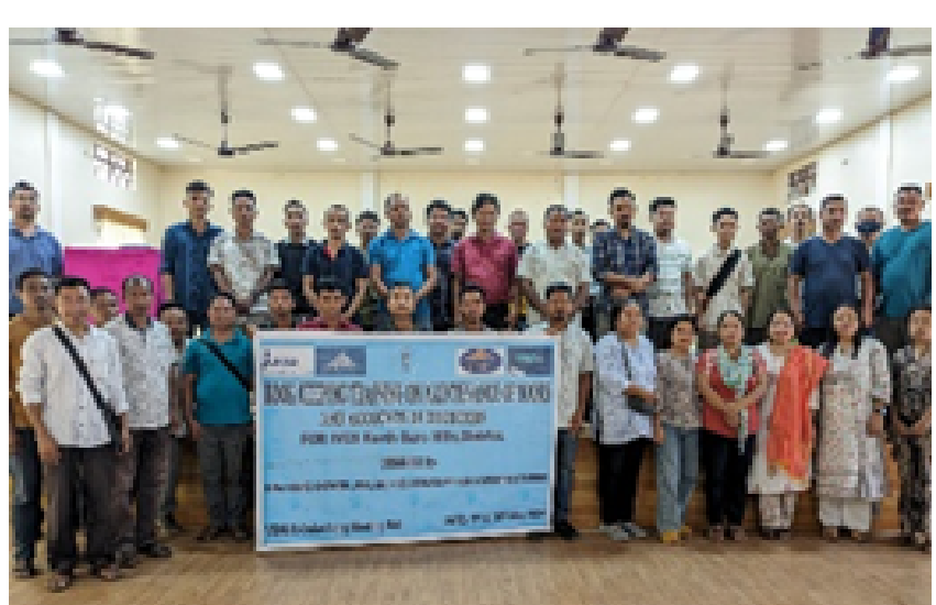
A two-day Bookkeeping Training session was held for the IVCS of Kharkutta C&RD Block in North Garo Hills on 9th May 2024 and 10th May 2024, at the Dekachang meeting hall in Resubelpara. The training was attended by 46 chairmen and secretaries representing 23 IVCS.