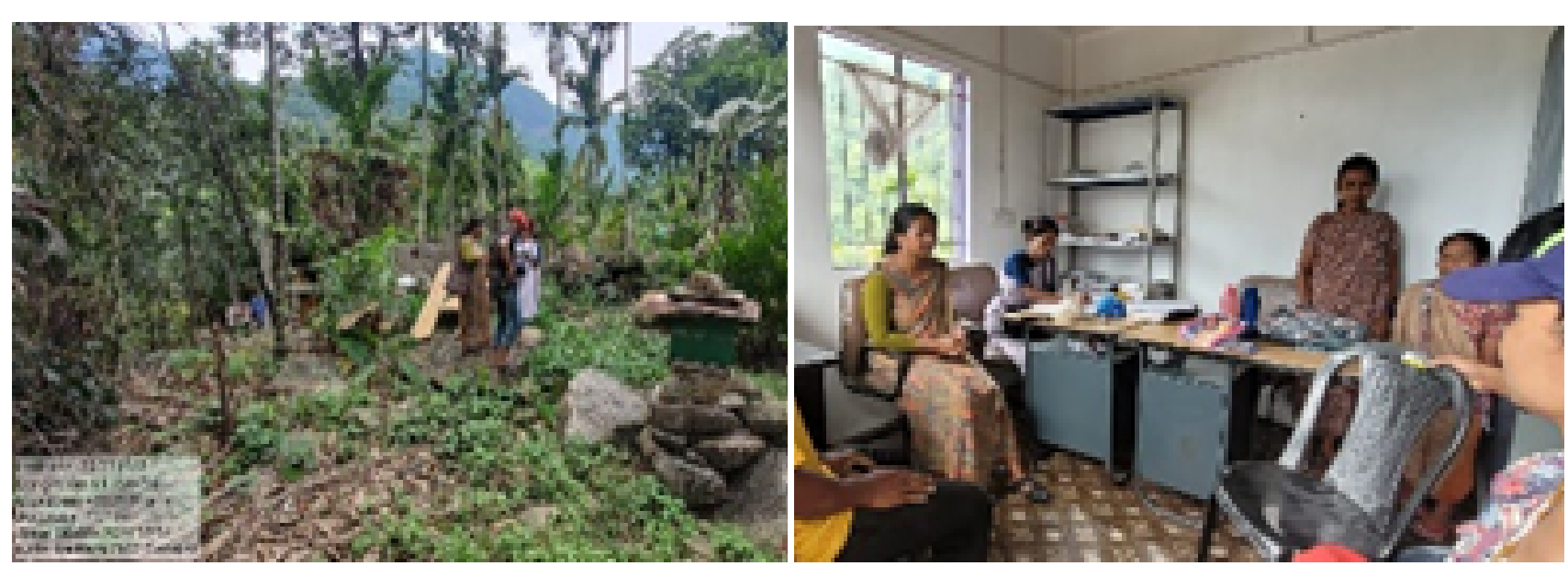
On 8th May 2024, an awareness programme was held at Laitiam IVCS, Laitiam, focusing on mobilizing membership, savings, and loans, along with a follow-up session on the Collective Marketing Centre (CMC) with the Managing Committee.