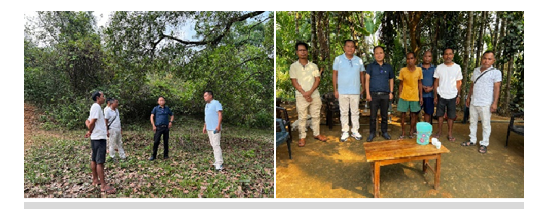
On 15th May 2024, a joint visit was conducted with the Divisional Officer from S&WCD, along with a meeting held with the headman and landowner regarding the construction of the new Prime Hub at Chokpot Warima village.