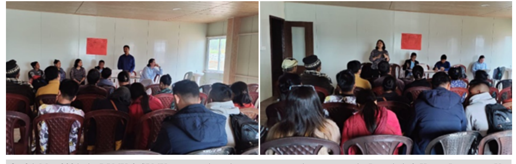
On 8th May 2024, the DPMU & SPMU team conducted an inspection and meeting on the Primehub & Honey Processing Unit located at Diengkynthong IVCS in Khatarshnong Laitkroh Block.