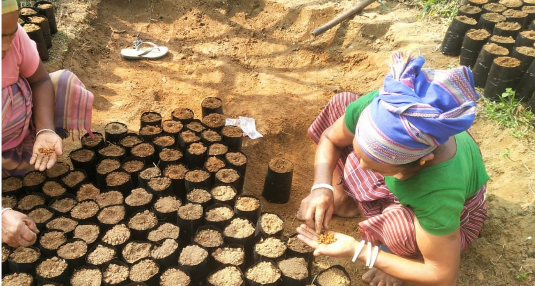
Belguri\ VPIC\ is\ engaged\ in\ the\ process\ of\ filling\ empty\ polybags\ with\ seeds\ of\ Assia\ fistula,\ Sinaru,\ Gabare,\ and\ Gmelina\ Arborea.