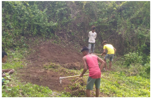
On May 8th, 2024, BPM, AM, and FE visited Kolkatola village in the Betasing Block, SWGH. Their objective was to assess the ongoing development of the Dug Out Pond and staking at the Plantation site. Furthermore, they initiated the construction of a water tank at Dagal Nokat village.