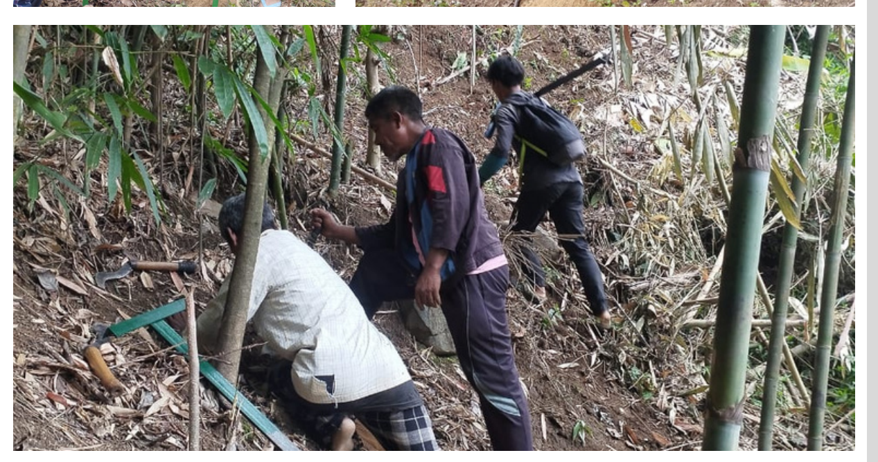
The Rongkugre Community Reserve in Chokpot, SGH, conducts activities focused on boundary demarcation and fire prevention and control.