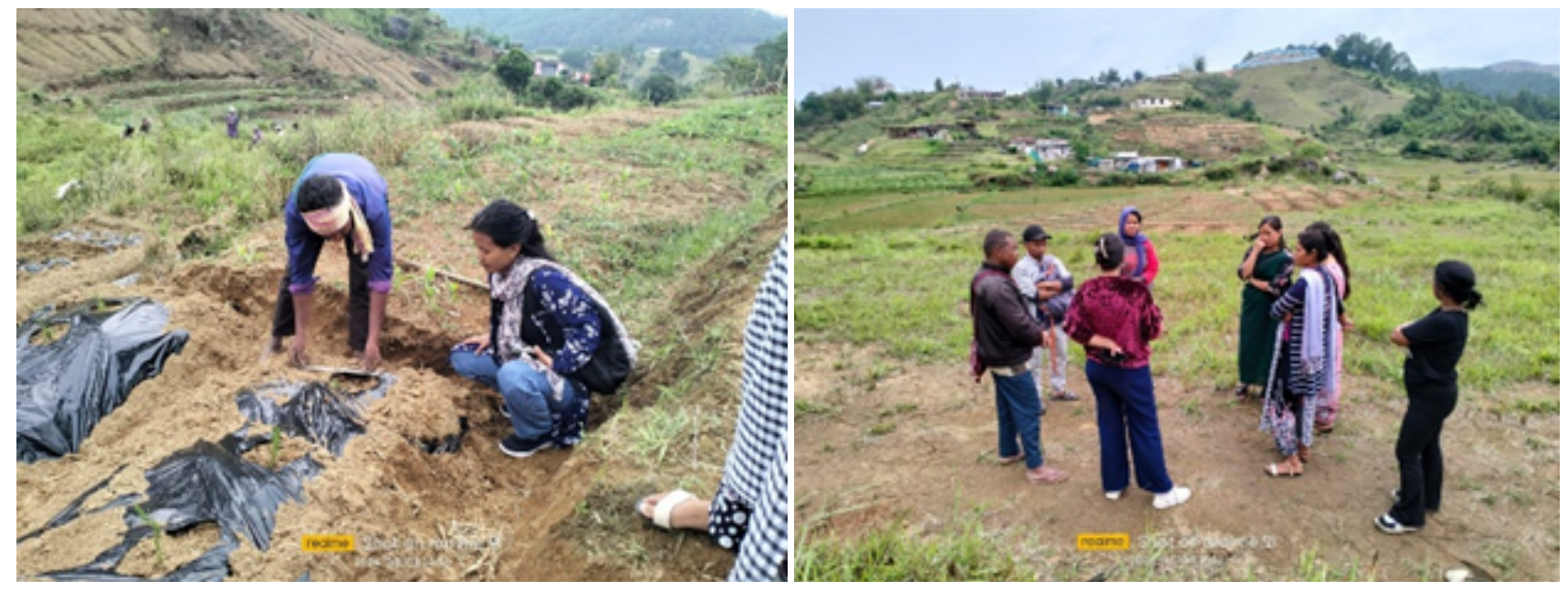
On 8th May an orientation cum awareness program was held on demo plots of potato, accompanied by a visit to a herbs garden cultivating rosemary and lavender. The joint inspection was conducted by the SPMU, CIP TA, and IVCS incharge at Laitnongrim IVCS.