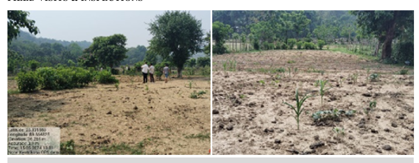
On 14th May 2024, a field visit was conducted to Kantrikona IVCS and Balughat IVCS to inspect the demo plot land for OPS. During the visit, there was an interaction with SPs to finalize the selection of vegetable seeds.