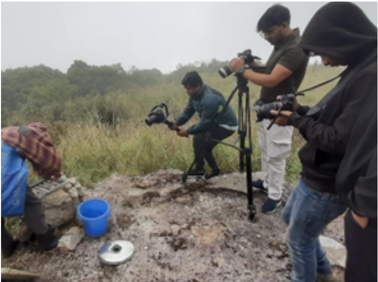
On 11th May 2024, officials from APEDA visited farmers of Diengkynthong, Mawlyndiar, and Nohkalikai for a video shoot showcasing the processing of bayleaf, cinnamon, and honey. The shoot was conducted in the presence of staff members from SPMU, DPMU, and MegLife of MBMA/MBDA.